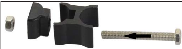
Disassembled Foot Mount, included with every Vision X LED Light Bar. Comes assembled.