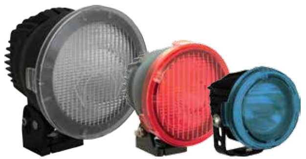
PCV-6500WF, PCV-CP1RWF, PCV-OPR1BEL Shown Light(s) Not Included