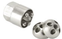
Part # - 9897349 Item # - XIL-SN06 Security Hardware