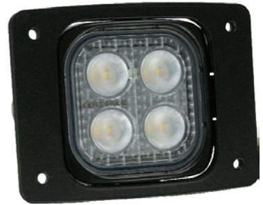
Flush Mount Ideal for bumpers