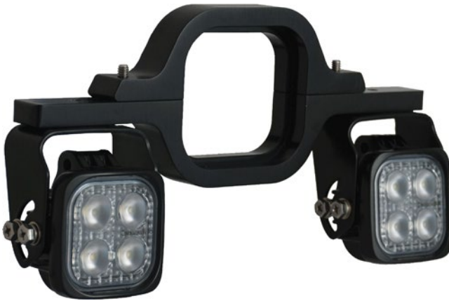
Part # - 4000322 Item # - XIL-SRECEIVER Tow Hitch Mount