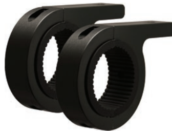
Part # - 9893372 Item # - XIL-C200 Clamp Tube Mount (0.75"-3.0" Diameter Available)