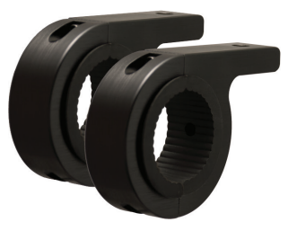
CLAMP TUBE MOUNT (0.75"-3.0" Diameter Available)