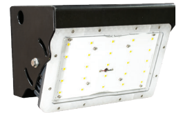
WALL PACK MOUNT KIT Part# : LSG0225180WP