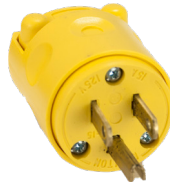
110V AC PLUG Part# : ****