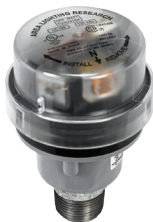
DUSK/DAWN SENSOR Part# : LUC-DTD