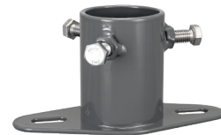
SLIP FITTING Part# : 2" Diameter : LUC-S2 2.5" Diameter : LUC-S2.5 3" Diameter : LUC-S2.5