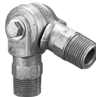
3/4" ADJUSTABLE SWIVEL Part# : ****