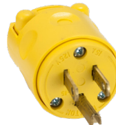
110V AC PLUG Part# : ****