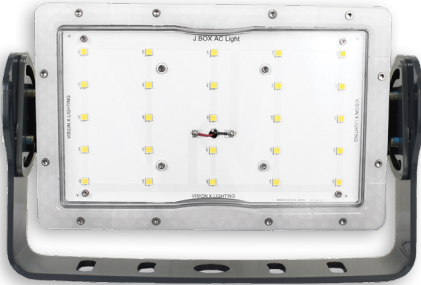
Standard Trunnion Bracket