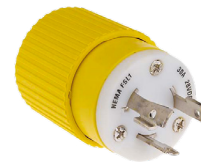
240-277V AC TWIST LOCK PLUG Part# : ****