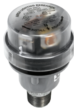
DUSK/DAWN SENSOR Part# : LUC-DTD