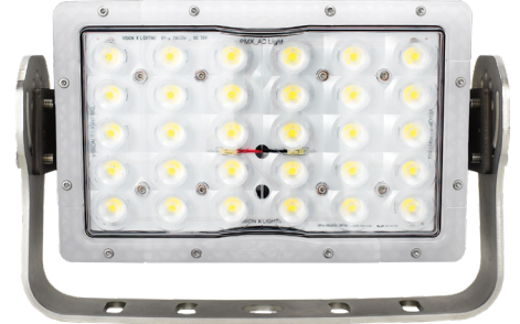
Stainless Steel Trunnion Bracket