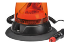
Magnetic Base OPT-85668A