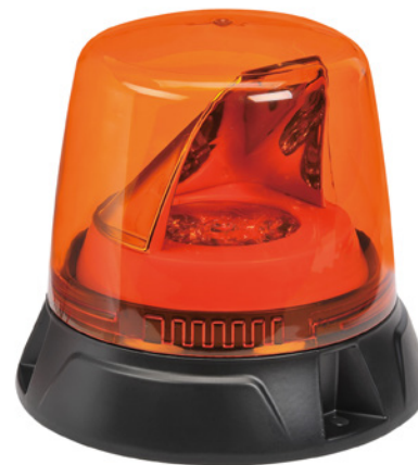
Flange Mounting PART# OPT-85660A