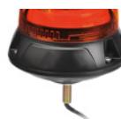
Single Bolt OPT-85662A