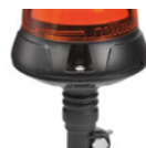
Flex DIN OPT-85666A