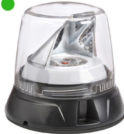
Amber/Green Dual Color PART# OPT-85660AG