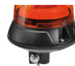
Fixed DIN OPT-85664A